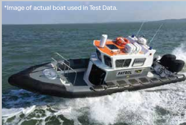
*Image of actual boat used in Test Data.