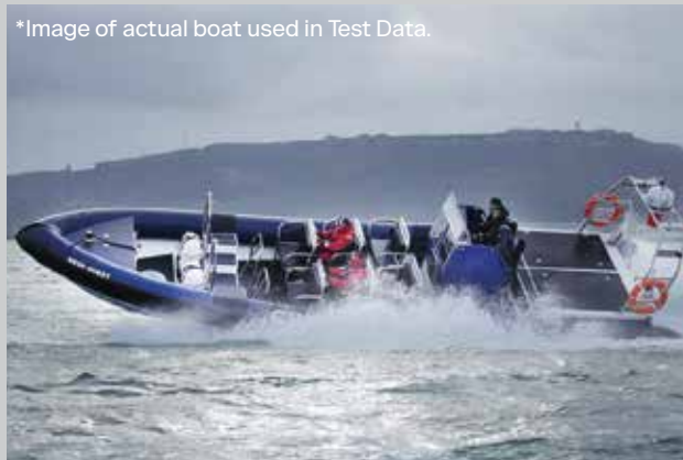
*Image of actual boat used in Test Data.